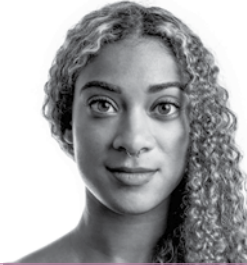
Princess Reid Jacksonville, FL